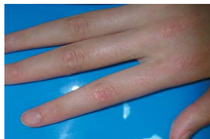
Figure 2 Sclerodactyly and Gottron's papules on PIP and DIP surface