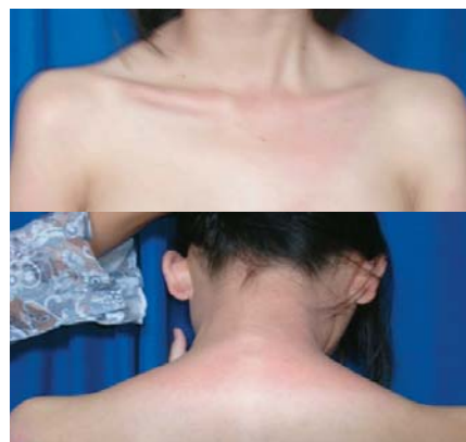
Figure 3 V sign and shawl sign