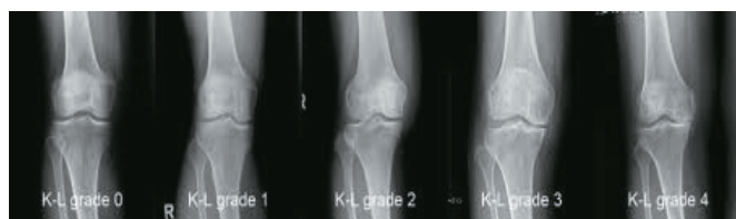
Figure 1. Kellgren Lawrence grading scale of knee OA

Knee OA severity was assessed according to the Kellgren Lawrence grading scale. Knee OA is classified into 5 grades (figure 1): grade 0 with normal radiologic findings; grade 1 with doubtful narrowing of joint spaces and possible osteophytic lipping; grade 2 with definite osteophytes and definite narrowing of joints space; grade 3 with moderate multiple osteophytes, definite narrowing of joints space, some sclerosis and possible deformity of bone contour; and grade 4 with large osteophytes, marked narrowing of joints space, severe sclerosis and definite deformity of bone contour. Radiographic examination of patients was done in a standing position, where anteroposterior (AP) and lateral projection of both knees were taken. Radiographs were then examined by three qualified radiologists that had been tested with a reliability test (kappa test).